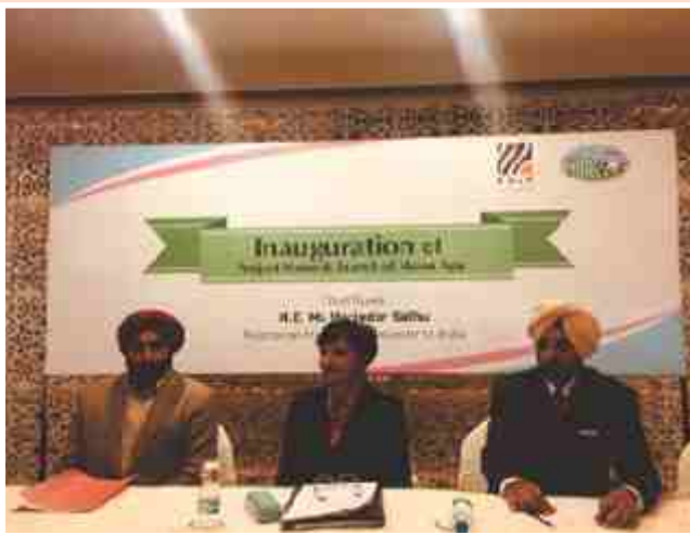
Project MOOO, Patiala