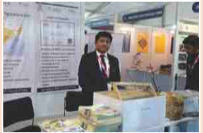
Momentum Jharkhand, Ranchi