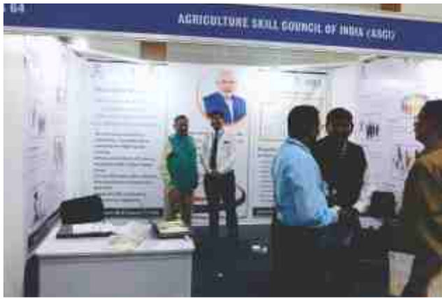
Indian Dairy Conference, Kochi